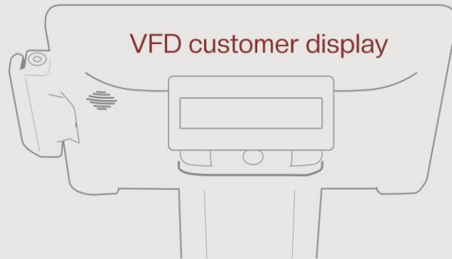
VFD customer display