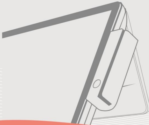
Combo Card Reader – MSR, Fingerprint, RFID, NFC and ibutton reader