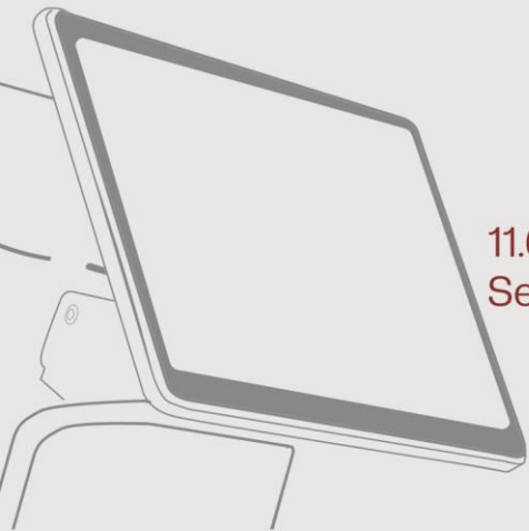
11.6inch Second Display